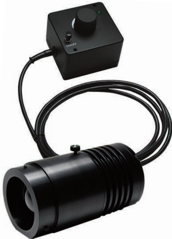
LDB100F Brightfield LED with flip-in 550 nanometer filter.

LED Illumination Systems for Brightfield Microscopy with Flip-in 550 Nanometer Filter